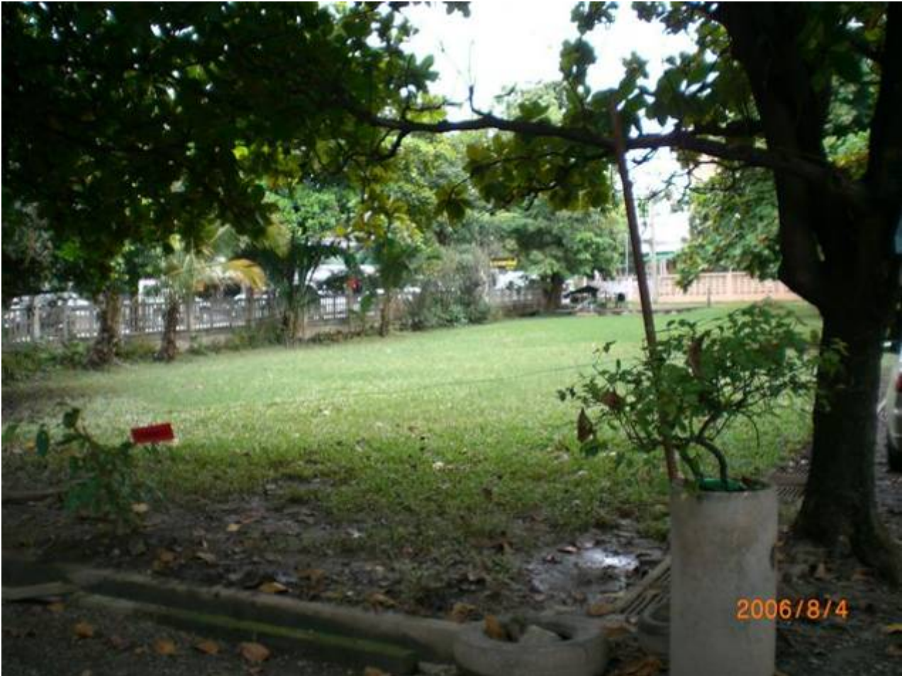
This land is in walking distance to the Night Bazaar