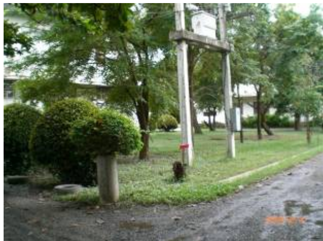
Even in any worst case scenario there is no flooding on this land